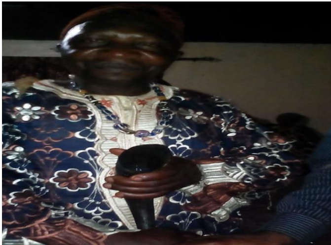
Figure 6: A wèd mbàn (family head) holding the to' inəbi (the family cup)

According to the participants (see Appendix C: 3) the key person in charge of the mbàn is the wèd mbàn , which translates “the family head”. Usually this person is a male.