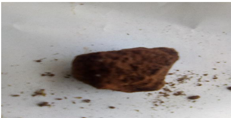
Figure 4: The pounded or ground cam wood that has been mixed with water and dried in preparation for use

According to the participants (see Appendix C: 8) members of the Meta' clan pound or grind cam wood tree to produce a powder called fibig . This powder is mixed with water and dried and preserved for later use. When it is to be used, a piece of this dry powder is cut and put on the iti ibig (cam wood stone); some water is sprinkled on it to make it into a paste. The wəd mbàn , in the presence of wəd fibig (the person who rubs cam wood), applies the paste on the forehead; chest or legs of the family members a sign of blessing. In an instance where there is no iti ibig (cam wood stone), a fresh plantain leaf is used for that purpose. It is spread on the ground and the cam wood is mixed on it.