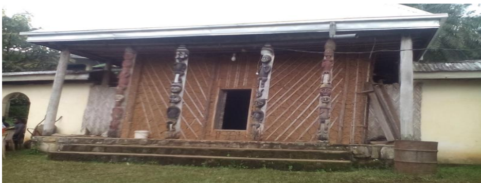
Figure 1: The mbàn (the Meta' family meeting house) of the palace at Njinibi

According to the participants (see Appendix B and C), the mbàn is a single-room house found in a strategic location in the yard of most families to enable easy access for everyone. Sometimes other rooms might be attached to it. Members of the Meta' clan usually call it “a family meeting house”. It is also a house where many rituals in the Meta' culture are performed. Except for family heads who are buried in compounds determined by senior clan members, Dillon (1985:3) also indicates that in the palaces, past chiefs were buried in the mbàn .