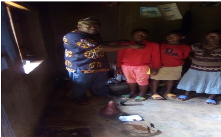
Figure 7: The wèd fibig (the person who rubs cam wood) rubbing fibig (cam wood) on the chest of some children

The second person in charge of the mbàn is the wèd fibig (the person who rubs cam wood). Participants (see Appendix C: 8) mention that not all families have the wèd fibig . In some families the wèd mbàn (family head) handles all the affairs of the family, including rubbing people with cam wood