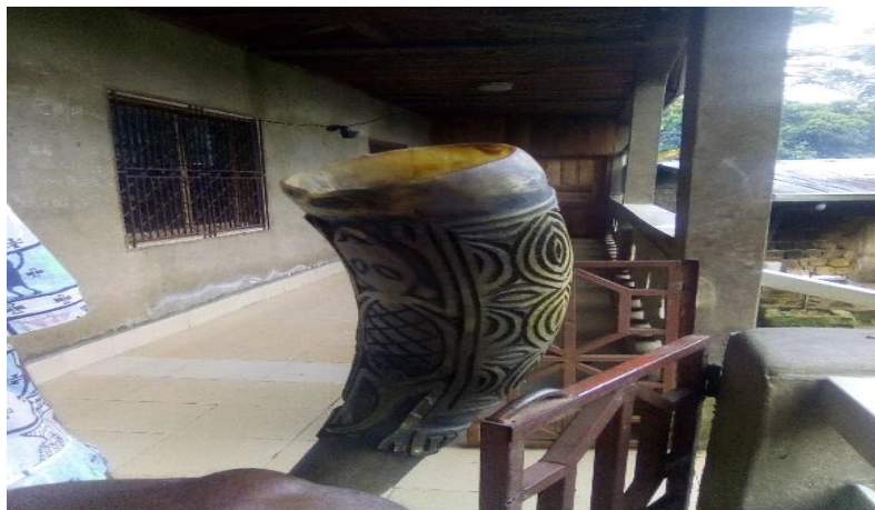
Figure 3: An example of the to' inəbi (family cup)